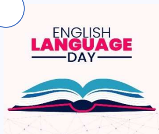
English Language Day