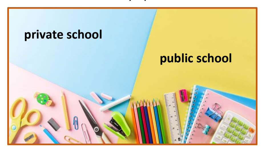
Which do you prefer?