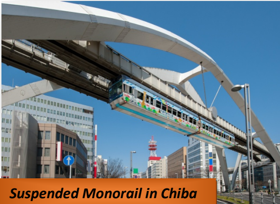
Suspended Monorail in Chiba

Directions: Below are different modes of transportation all over the world. Which of the following would you like to try or have you tried?