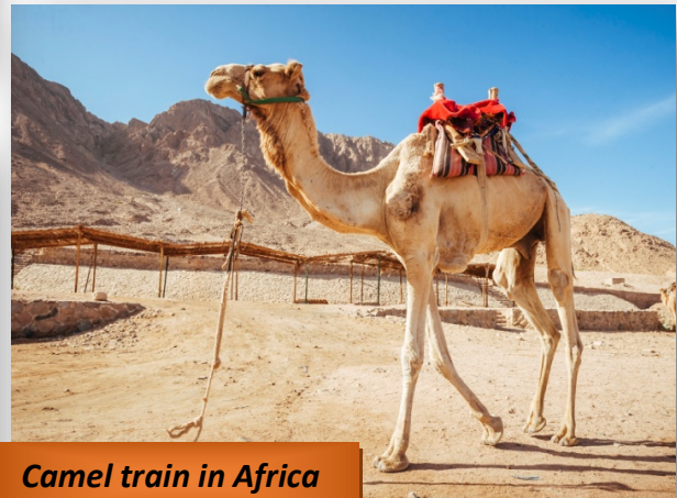
Camel train in Africa