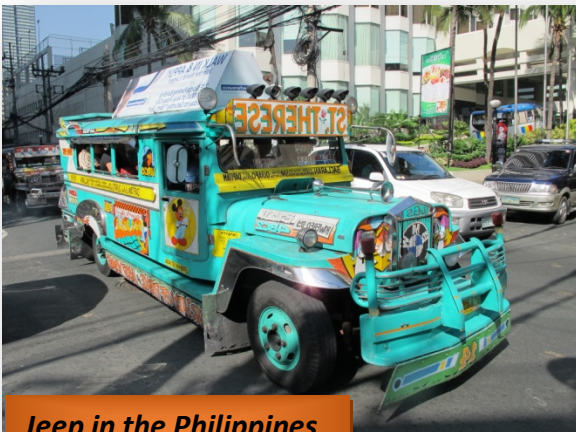
Jeep in the Philippines