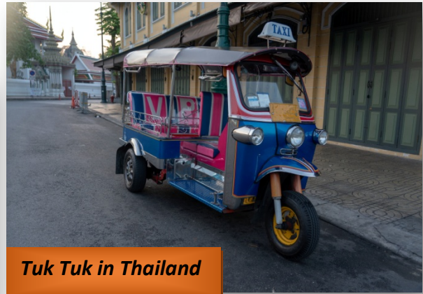
Tuk Tuk in Thailand