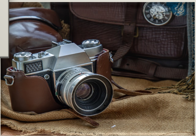
an old camera