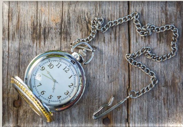
an antique pocket watch

Directions: Which two collectibles would you purchase from a flea market? Explain your answers.