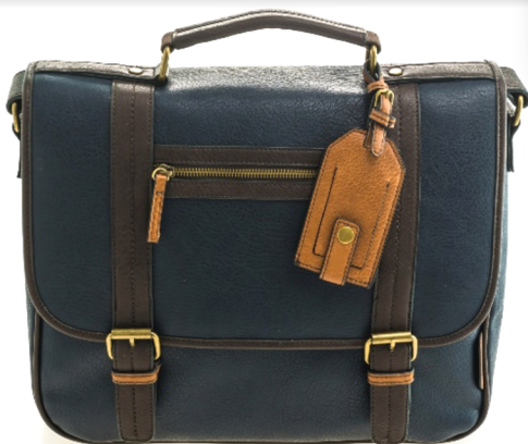
an expensive leather bag