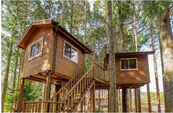
rent a cabin in the woods

Directions: What would you do or not do for your party? Explain why.