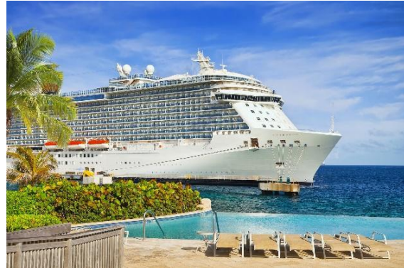
take a cruise