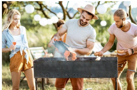
throw a backyard BBQ party