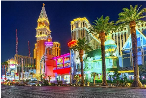
head to Vegas