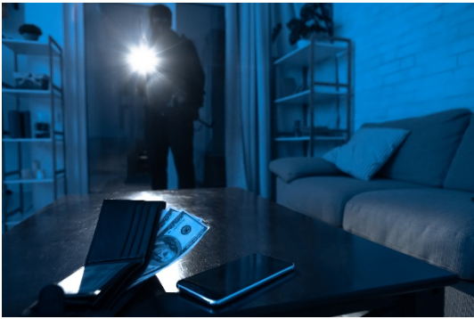
a man breaking into your home

Directions: Call 9-1-1 and ask for help.