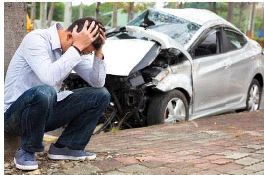
a car accident outside