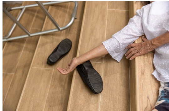
an elderly woman falling down the stairs