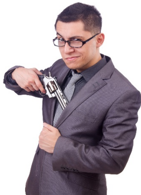
a man with a gun appearing in the office next door